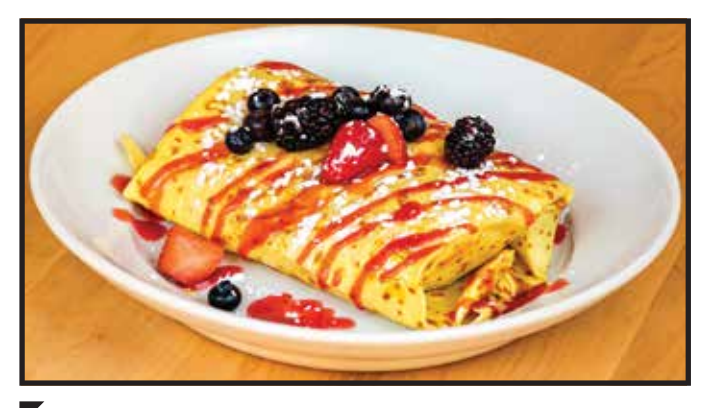
▼ Berry Crepe