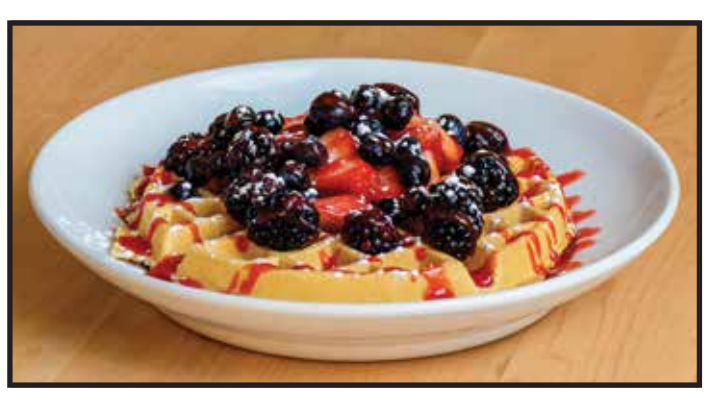
▼ Berry Waffle ↑