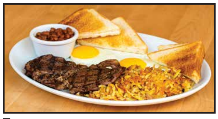
▼ Steak & Eggs