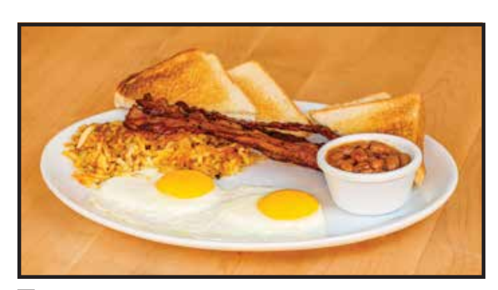
Classic Breakfast with Bacon